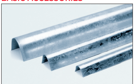
TFK-4 galvanized steel channel 30 mm x 21 mm (1.18" x .84") covers SnapTrace heat transfer compound applied to 3/8" or 1/2" O.D. tube tracers.

Stainless steel TFK channels are also available.